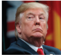
Overruled: 128 votes against Trump

MORE than 120 countries yesterday defied Donald Trump's recognition of Jerusalem as Israel's capital, voting it as 'null and void'. The UN General Assembly voted 128-9 calling for the US to drop its declaration. Mr Trump, who said he would move the US embassy to Jerusalem, had threatened to cut financial aid to countries voting against this. His threat appeared to have some impact, with 35 countries abstaining and rejecting the resolution. This was